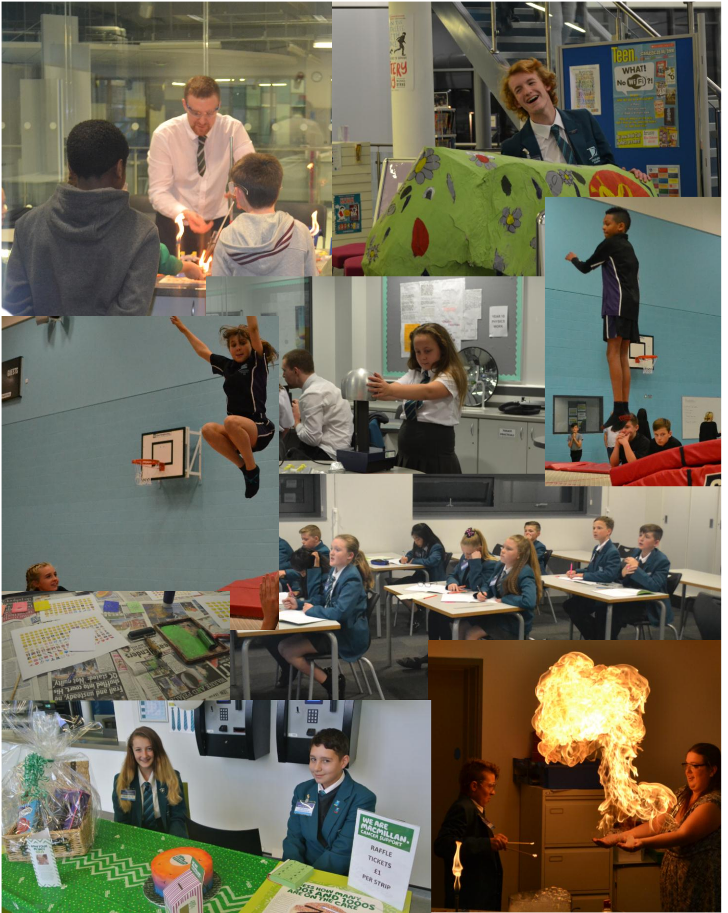
Great learning through politeness, honesty and hard work