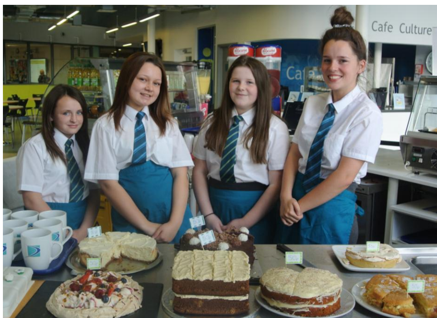
Great learning through politeness, honesty and hard work

The Academy holds a MacMillan Coffee Morning and raises £169 for this very worthwhile cause. Thank you to students, staff and parents for supporting the event.